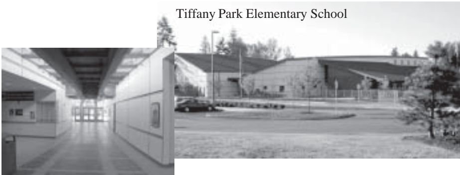
Tiffany Park Elementary School