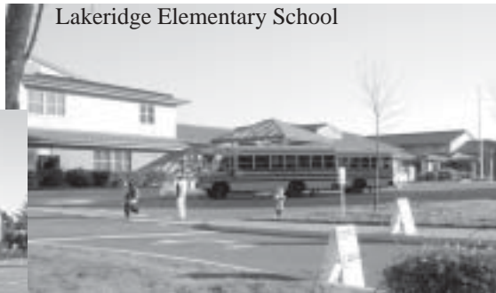
Lakeridge Elementary School