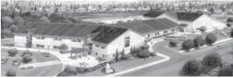
Campbell Hill Elementary School

Pictured are some of the projects paid past phases of voter-approved school construction bond measures.