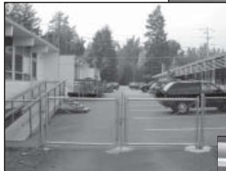
Hazelwood Elementary School uses portables to provide basic programs.