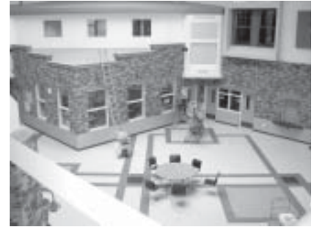
Renton High commons