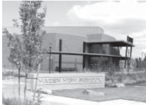
Hazen High School auditorium