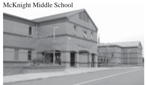
McKnight Middle School

For more information about the Renton School District bond election, contact the Community Relations Office at 425.204.2345 or visit the district's Web site at www.renton.wednet.edu