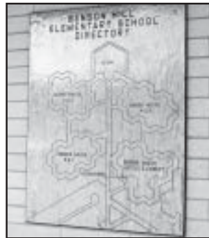
A directional sign shows Benson Hill's detached design

If passed, the total tax rate—including this bond, previous bonds and the voter-approved education levy—will be an estimated $3.78 per/$1,000 of assessed value, keeping the Renton School District tax rate among the lowest in the region.