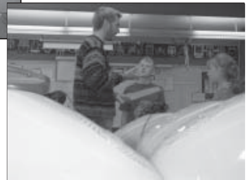
Renton Park Elementary School does not have the electrical power needed to simultaneously run groups of computers while other devices are on.