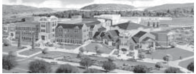
Renton High School & IKEA Performing Arts Center