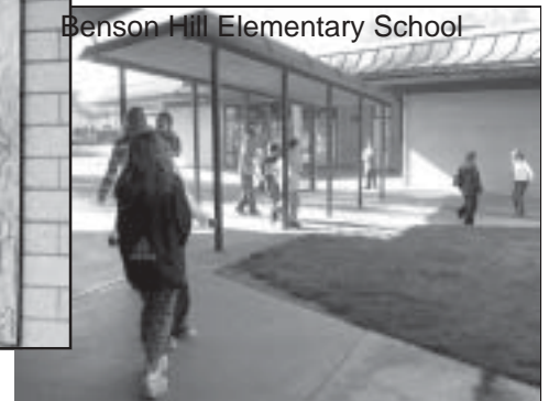
Benson Hill Elementary School The design of Benson Hill Elementary School—having students walk outside to pass between classrooms—is a significant health and safety concern.