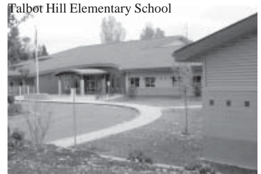
Talbot Hill Elementary School