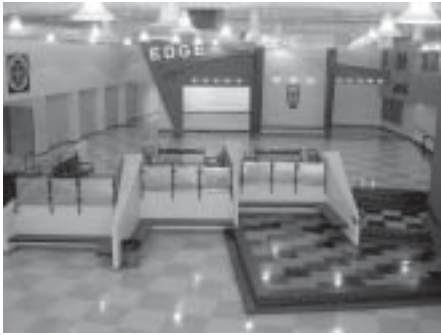
Hazen High commons