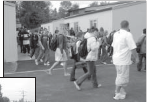
Students at Lindbergh High School learn in portables while part of the school is upgraded.