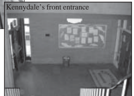
Kennydale's front entrance

Kennydale Elementary School—whose entrance way allows unsupervised access to classrooms on the upper level and causes students to walk outside to pass between classrooms and go to the restroom—is a significant health and safety concern.