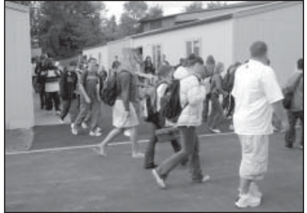
Students move between portable classrooms during passing time

To provide students a place to learn during construction, the district over the summer brought in 12 portable classrooms. The portables are complete with computer and telephone connections, as well as intercom communication between offices and classrooms. Asphalt paving was placed around the portables to keep students out of the mud when the fall rains begin.