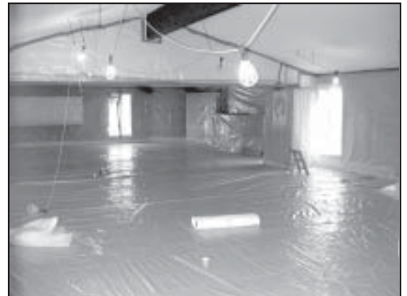
A classroom is covered in plastic in preparation for asbestos remove

There will not be much change to the exterior of the building or to the structure of most of the classrooms and offices. Most of the improvements will be made to interior systems. The project is scheduled to last about two years.