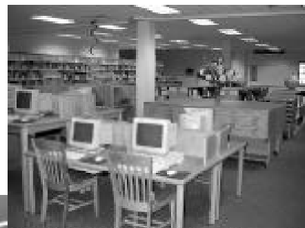
The new library