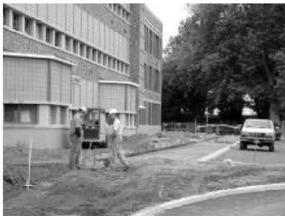
Prep work for sidewalk installation near staff parking lot and main entrance on west side

Breakfast and lunch will be served while the kitchen is being remodeled. We will serve a variety of items. New this year, students and staff will be able to pre-order Deli Sandwiches and Salads (orders must be placed the day before). Look for order forms when school starts.